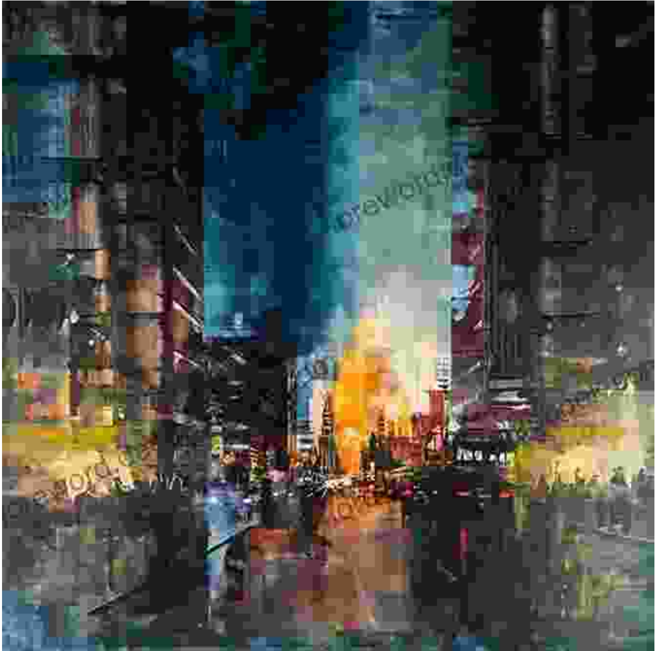
Gary Robinson, "Cityscape," Acrylic on canvas.

While Robinson's use of color is undeniably striking, it is the subject matter of his paintings that truly captivates the viewer. His canvases are a mosaic of life's most poignant moments, from the serenity of nature to the bustling energy of urban landscapes.