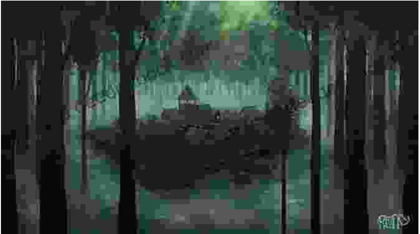
The Peculiar Inhabitants of Ronen Simian