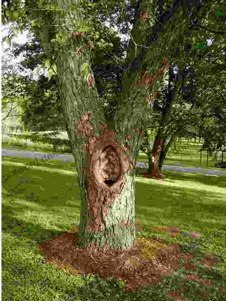
The tree with the hole

Billy and Sally used the magnifying glass to examine the hole, and they saw that there was a small key hidden inside. They used the compass to figure out which direction the keyhole was pointing in, and then they used the key to open the door.