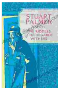
Image Alt Text: Hildegarde Withers, a middle-aged woman with piercing blue eyes and a keen expression, standing confidently in a classroom, surrounded by books.

influential character for generations. As the world continues to evolve, Hildegarde's legacy as a symbol of female empowerment and intellectual prowess will undoubtedly endure.