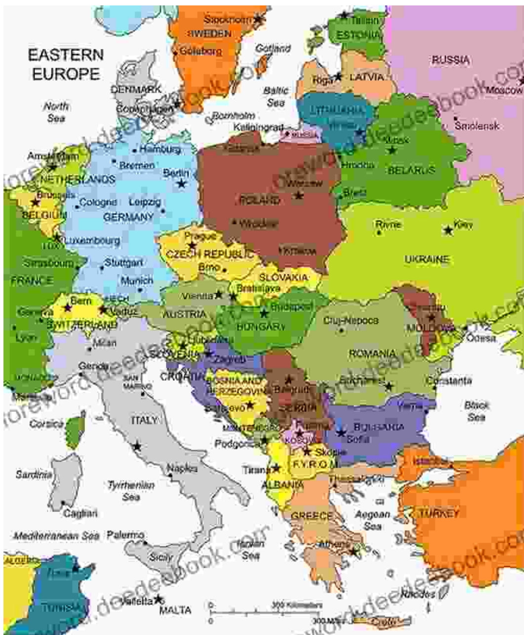
Map of Eastern Europe

and change, it is likely to play an increasingly important role on the world stage.